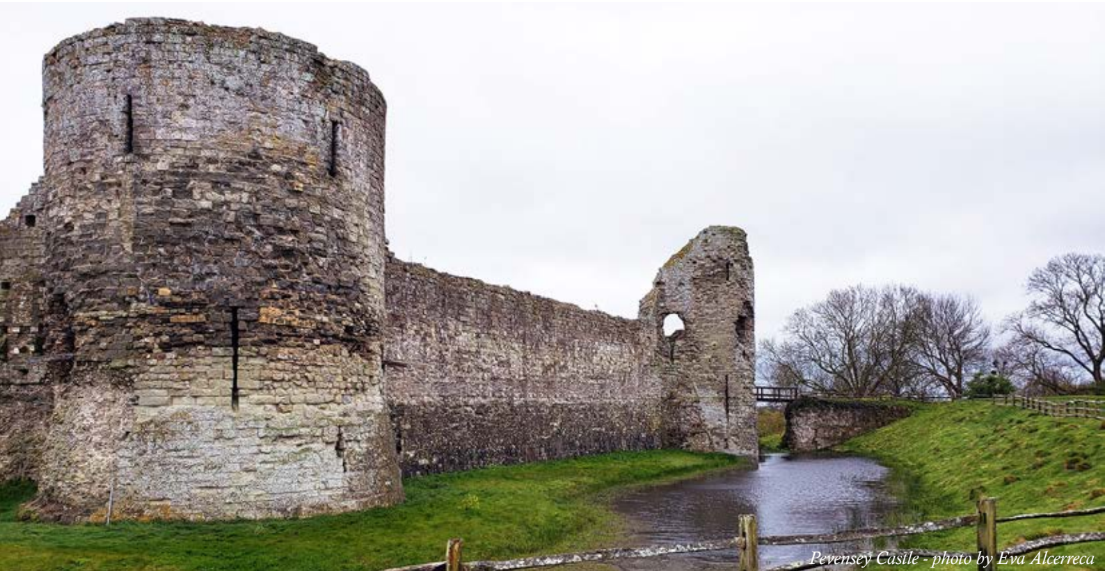
Pevensey Castle