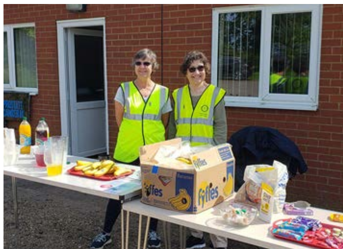
Wolsey Rotary members' wives helping at the checkpoints