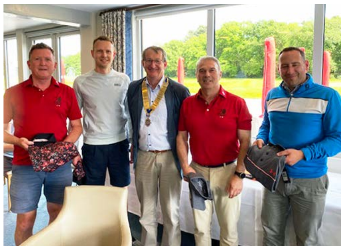
The Barnes Construction team, winners of the Sponsor's team prize