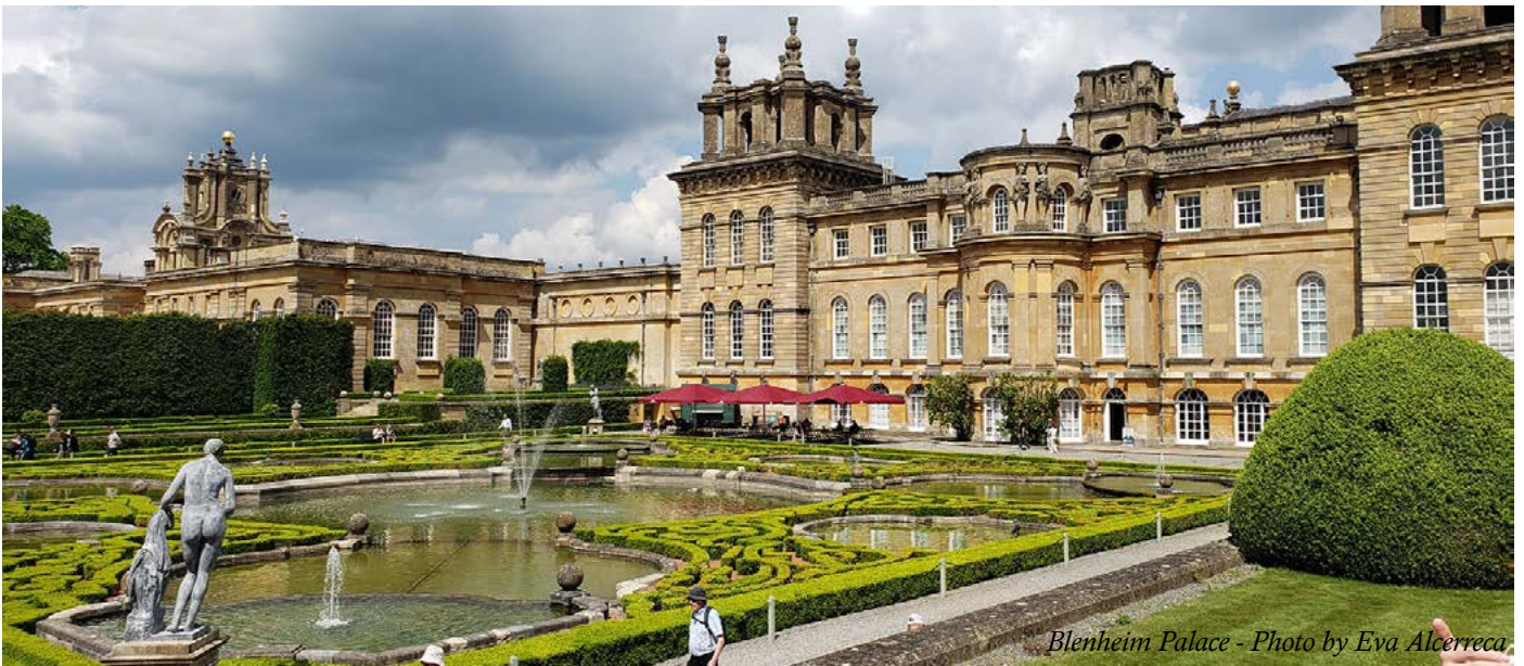
Blenheim Palace

During her year in office she hopes to raise thousands of pounds for the Eden-Rose Coppice Trust, the Ipswich Housing Action Group (IHAG) and Cancer Support Suffolk.