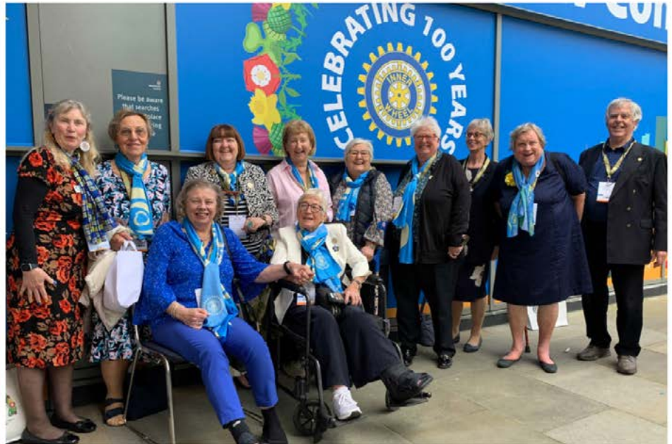
Above: as many of the D8 delegates as we could muster posed outside the convention centre.