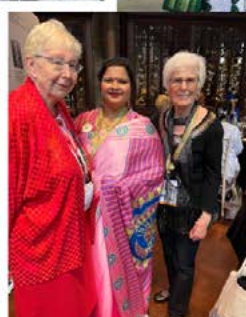
Many delegates co-ordinated their outfits to bring a riot of colour to the proceedings.