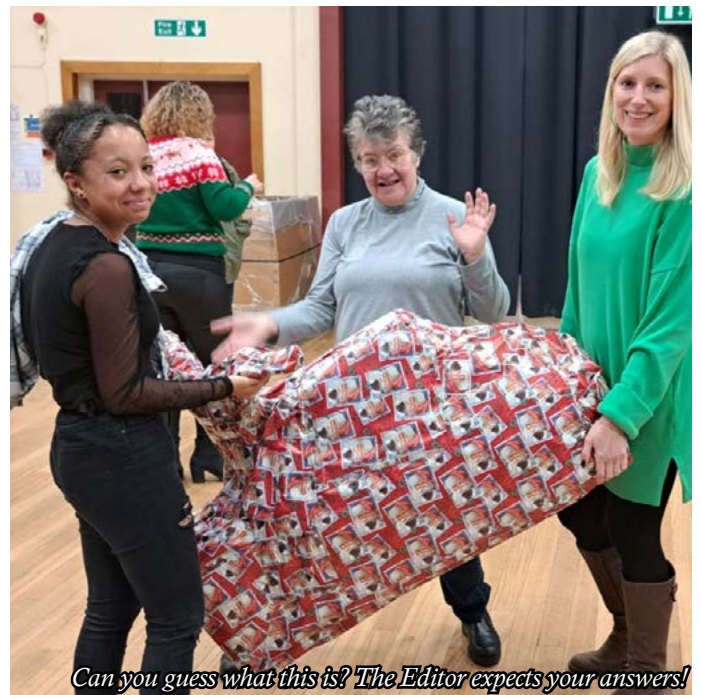
Can you guess what this is? The Editor expects your answers!